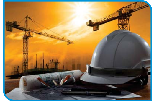
Operation Improvement / Safety Evaluation