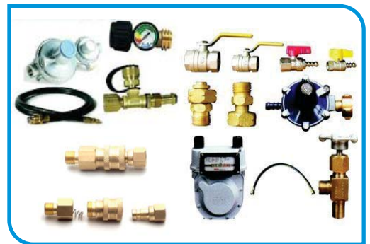
Procurement / Supply of LPG Equipment