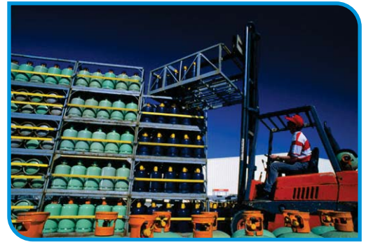
Marketing & Distribution